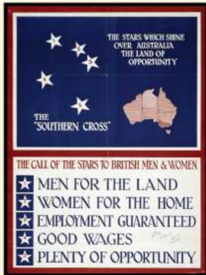
Propaganda recruiting to the British Empire Migration Program, 1924