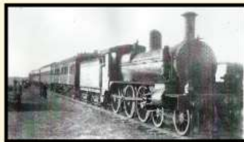
Official opening of Kerang - Gonn Crossing (Murrabit) Railway, 20 December 1924 (Don Potts)