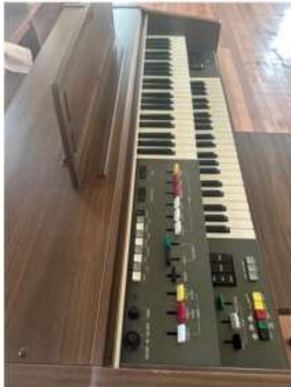
Yamaha Electone Organ plus Seat Model BK 5C $200- Excellent Condition