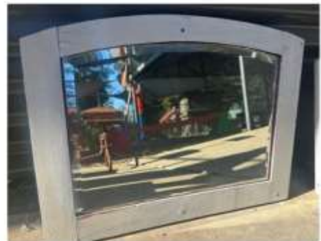
1 x Curved Top Mirror $10