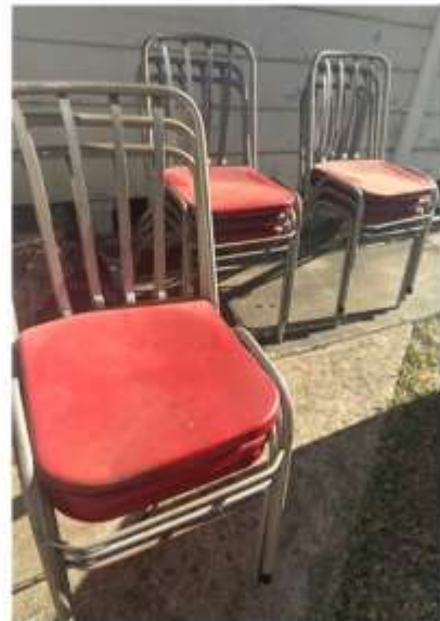
18 x Red Retro All Steel Chairs $10 each