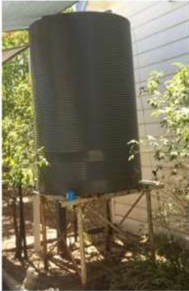
2100 Polymaster tank $500 Tank Stand $100

The Murrabit Advancement Association has the following items for sale.