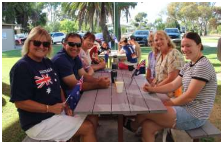
Pictured above: Murrabit residents enjoying Australia Day breakfast and below: local children enjoying the 20th annual Murrabit Floatilla on the Murray River.