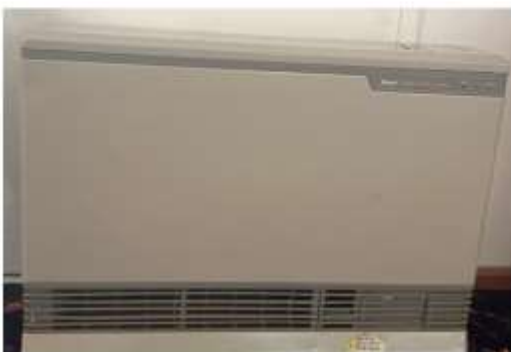
240v Rinnai Gas wall heater $100

All items good second hand condition Inspection welcome Payment on pick-up. Contact 5457 2205. Items not sold will be sold at the Murrabit Market so be quick if you are interested.