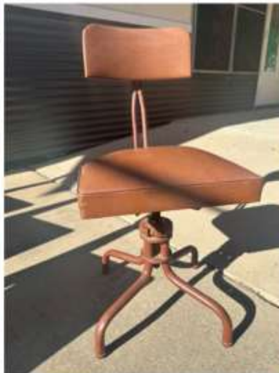
1 x Retro office chair $20