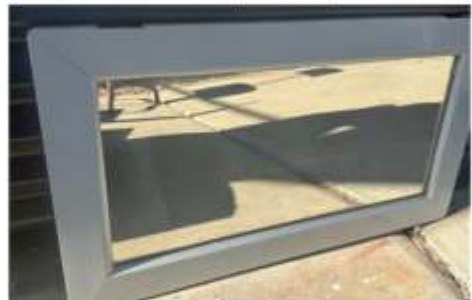
1 x Rectangle Mirror $10