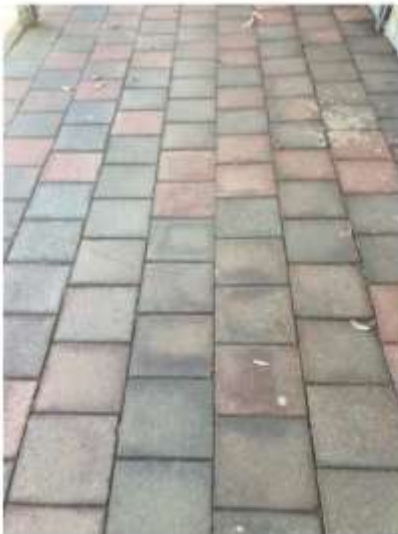
560 - 225 x 200mm Pavers Approx 30m2 $500 Buyer to remove 2-4 March