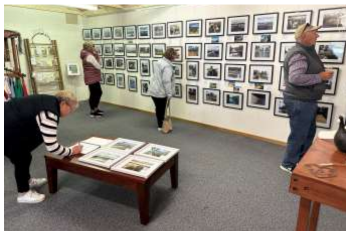
Pictured above: Gannawarra Flood Reflections Exhibition on display in Busy Bees of Murrabit.

The Gannawarra 2022 Flood Reflections Exhibition was on display in Busy Bees of Murrabit from 19 May to 1 June. It was great to see so many locals and visitors view this high quality exhibition while in town. Prior to that it was on display in Kerang for a month and has since been on display for a month in Cohuna. Next the exhibition moves on to Quambatook for a month. Great to see so many Murrabit & District photos and stories included.