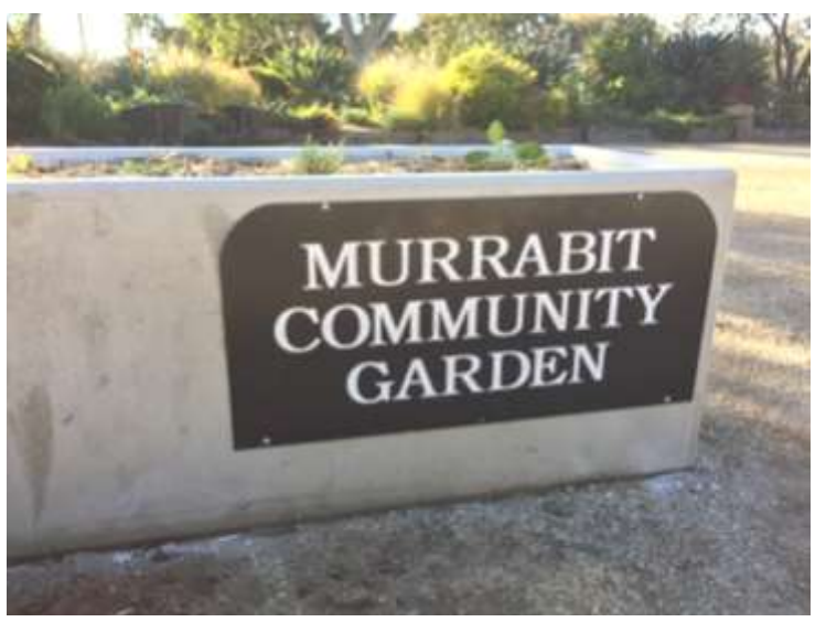
Murrabit Community Garden