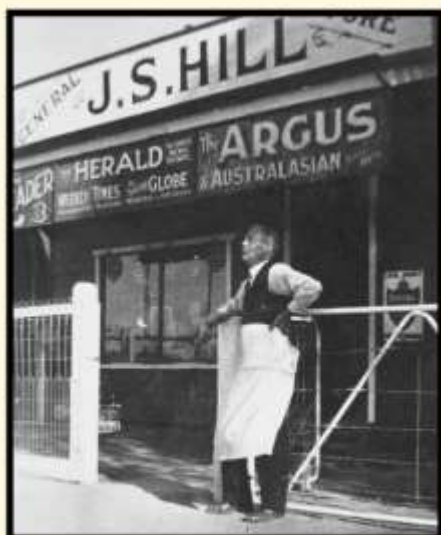
Jack Hill's Store