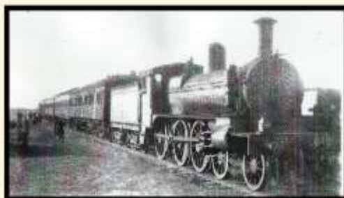
Official opening of Kerang - Gonn Crossing (Murrabit) Railway, 20 December 1924 (Don Potts)