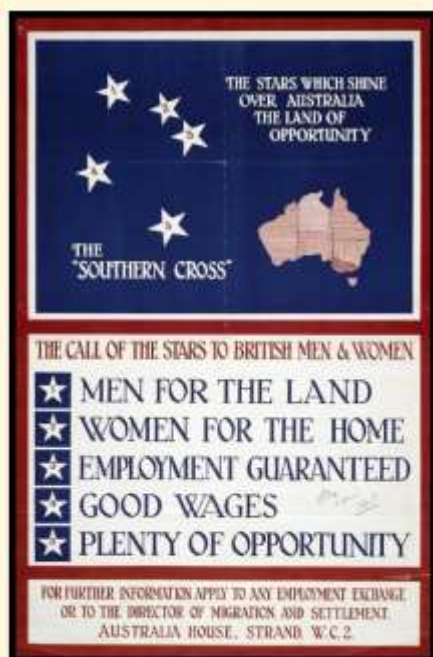
Propaganda recruiting to the British Empire Migration Program, 1924